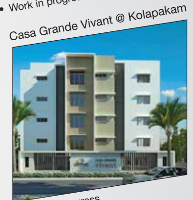
Casa Grande Vivant @ Kolapakkam