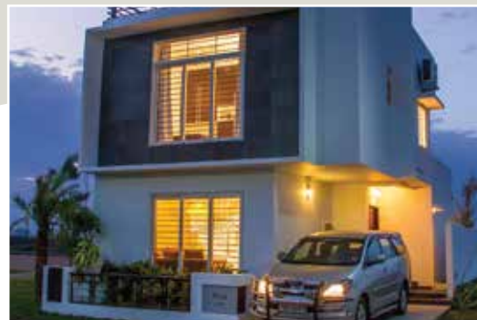
Casa Grande Elan @ Thalambur, OMR, Chennai