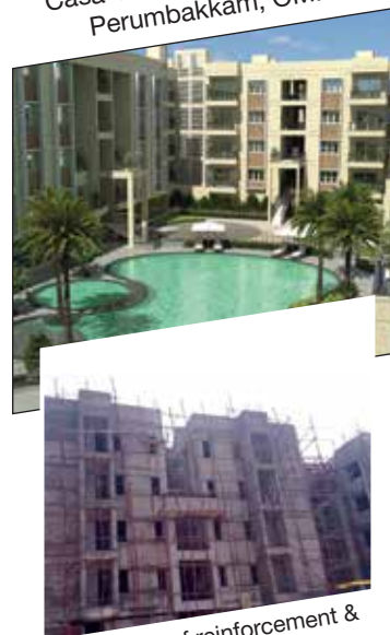
Casa Grande Cherry Pick @ Perumbakkam, OMR