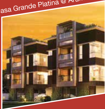
Casa Grande Platina @ Arumbakkam