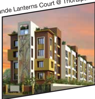
Casa Grande Lanterns Court @ Thoraipakkam, OMR