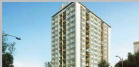
Casa Grande Multistorey Apartments @ Mount Road