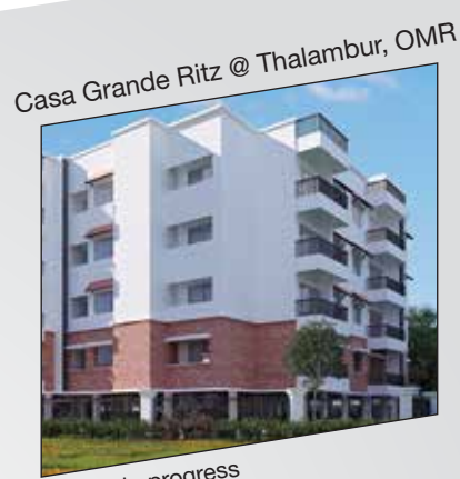
Casa Grande Ritz @ Thalambur, OMR