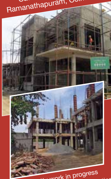
Casa Grande Amber @ Ramanathapuram, Coimbatore