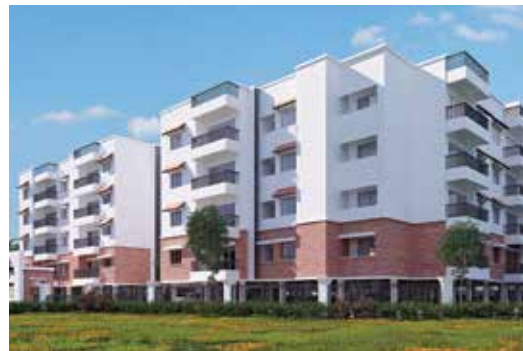
Casa Grande Ritz @ Thalambur, OMR, Chennai