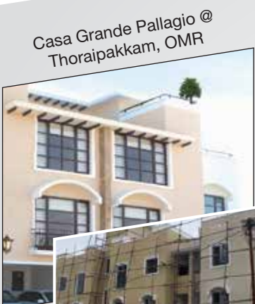
Casa Grande Pallagio @ Thoraipakkam, OMR