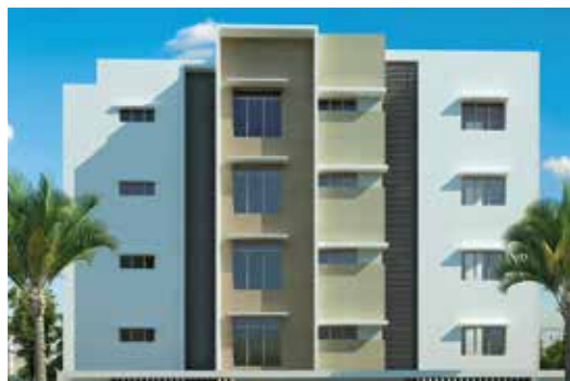
Casa Grande Vivant @ Kolapakam