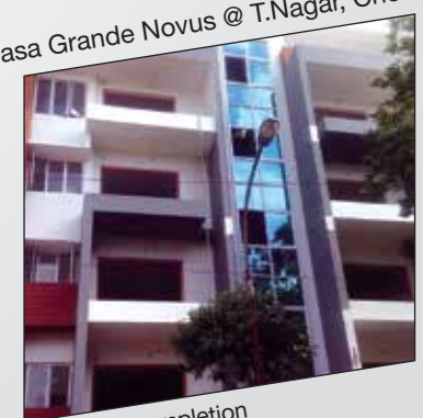
Casa Grande Novus @ T.Nagar, Chennai