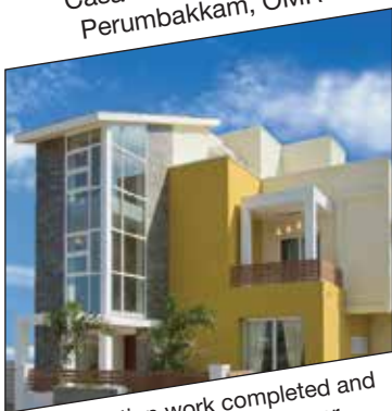
Casa Grande Avalon @ Perumbakkam, OMR