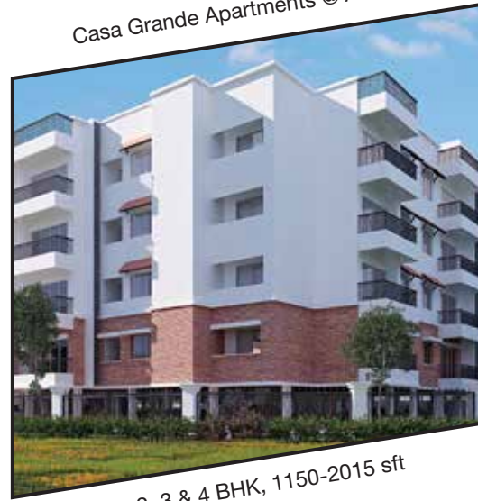
Casa Grande Apartments @ Alandur