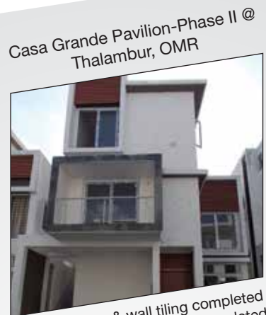
Casa Grande Pavilion-Phase II @ Thalambur, OMR