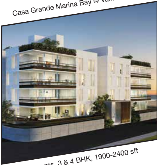
Casa Grande Marina Bay @ Valmiki Nagar