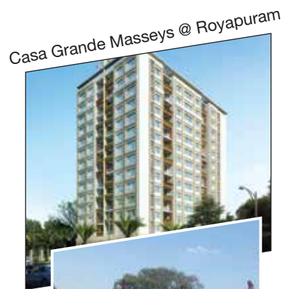
Casa Grande Masseys @ Royapuram