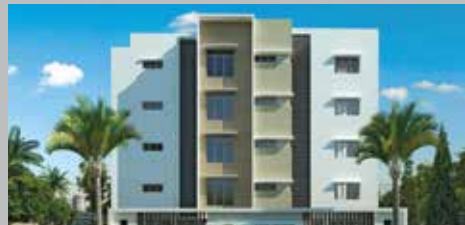
Casa Grande Apartments & Villas @ Manapakkam