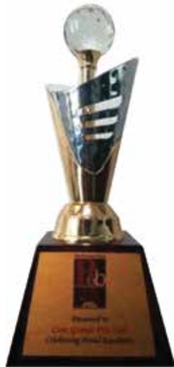
Best Realty Brand, Economic Times, 2015