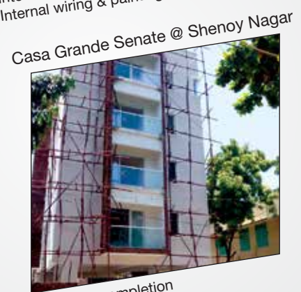
Casa Grande Senate @ Shenoy Nagar