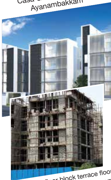
Casa Grande Cedars @ Ayanambakkam