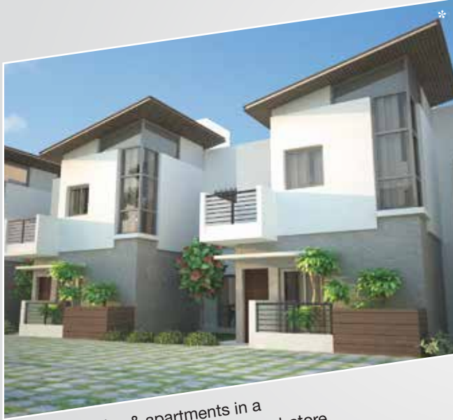
Retirement villas & apartments in a 2.45 acre expanse @ Vadavalli, Coimbatore