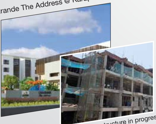
Casa Grande The Address @ Karapakkam, OMR