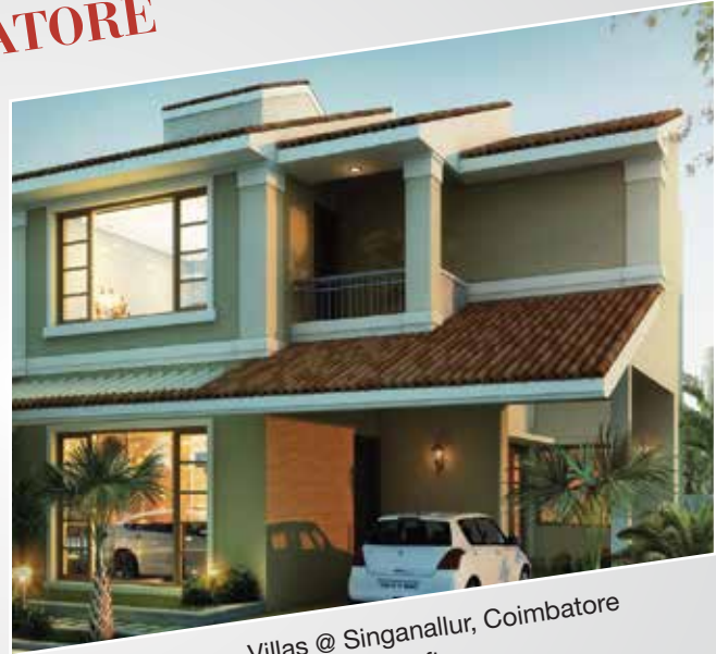
Casa Grande Tiara - Villas @ Singanallur, Coimbatore • 34 units, 3 & 4 BHK, 2450-3000 sft