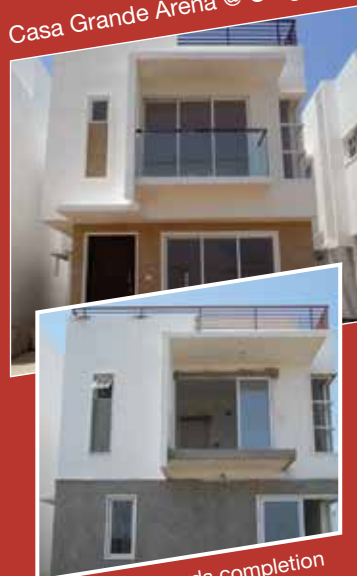
Casa Grande Arena @ Oragadam