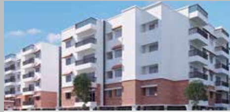
Casa Grande Apartments @ Alandur