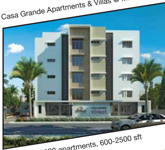
Casa Grande Apartments & Villas @ Manapakkam