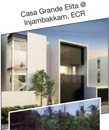
Casa Grande Elita @ Injambakkam, ECR