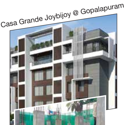
Casa Grande Joybijoy @ Gopalapuram