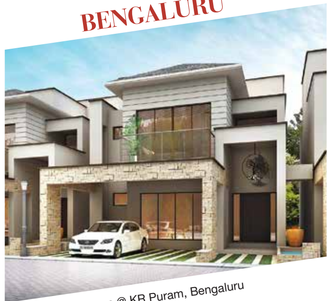
Casa Grande Luxus @ KR Puram, Bengaluru • 112 villas and 12 apartments