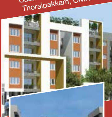
Casa Grande Aldea @ Thoraipakkam, OMR