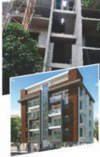
Casa Grande Novus @ T. Nagar