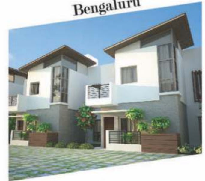
Casa Grande Shamrock - Villas @ Off Bannerghatta Road, Bengaluru • 4 BHK Villas, 3600 sft onwards