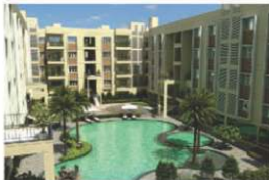
Casa Grande Cherry Pick @ Perumbakkam