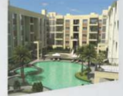
Casa Grande Cherry Pick @ Perumbakkam