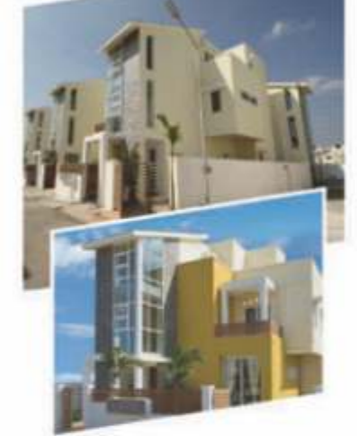
Casa Grande Avalon @ Perumbakkam