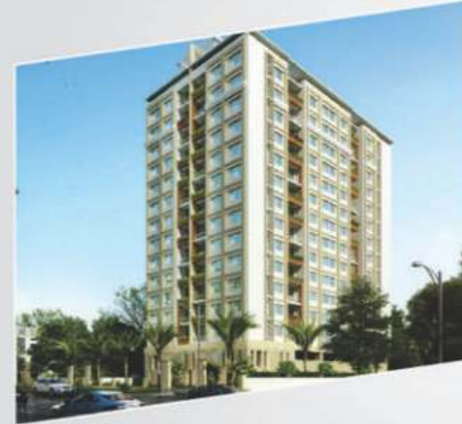
Casa Grande Massey - Apartments @ Royapuram, Chennai • 2 & 3 BHK, 1250 sft onwards