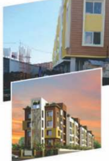
Casa Grande Lanterns Court @ Thoraipakkam