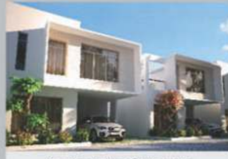
Casa Grande Elan @ Thalambur