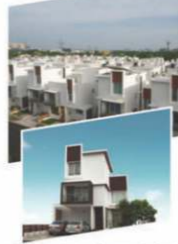
Casa Grande Pavilion Phase I @ Thalambur