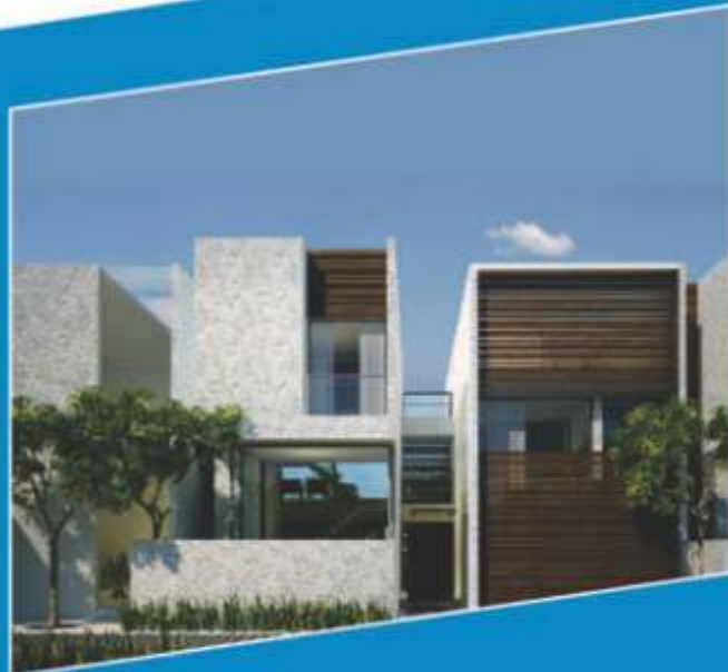
Casa Grande Elita - Villas @ Injambakkam, Chennai • 4 BHK Villas, 3500 sft onwards