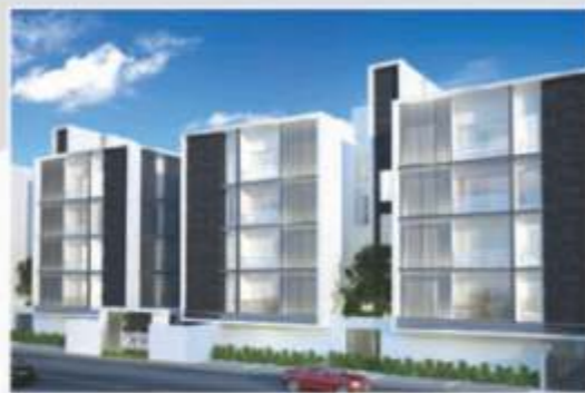
Casa Grande Cedars @ Ayanambakkam