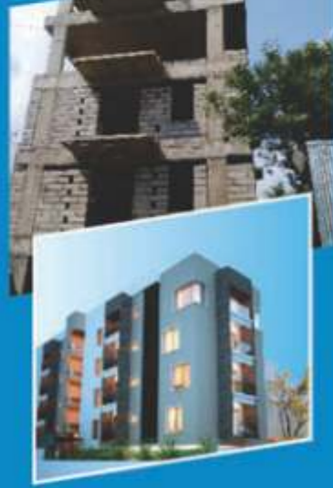
Casa Grande Senate @ Shenoy Nagar