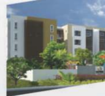
Casa Grande The Address @ Karapakkam