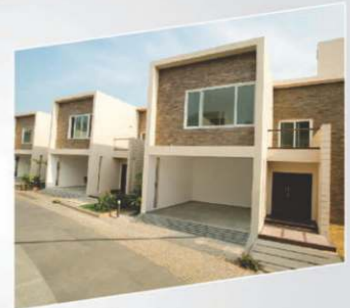
Villas @ Uthandi- ECR, Chennai • 3 BHK - 2 Living, 2400 sft onwards