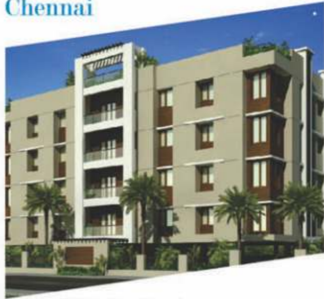
Apartments @ Kolapakkam, Chennai • 2 & 3 BHK, 1000 sft onwards