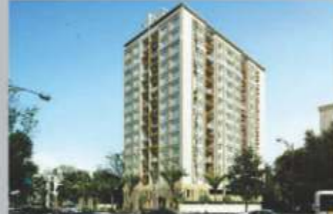
Casa Grande Massey @ Royapuram

Awarded the most admired project in the southern region by Worldwide Achievers