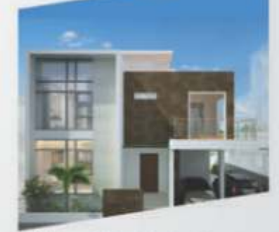
Casa Grande Amber @ Coimbatore