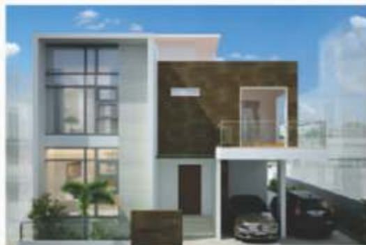
Casa Grande Amber @ Coimbatore