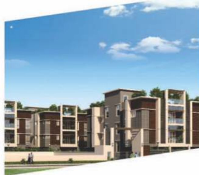
Apartments @ Gopalapuram, Chennai • 4 BHK, 2650 sft onwards