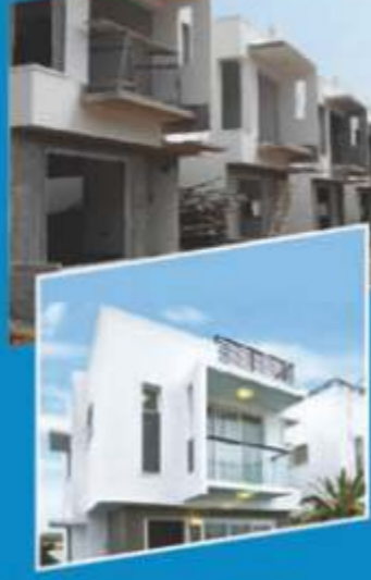
Casa Grande Arena @ Oragadam