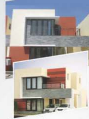
Casa Grande Eterna @ Coimbatore