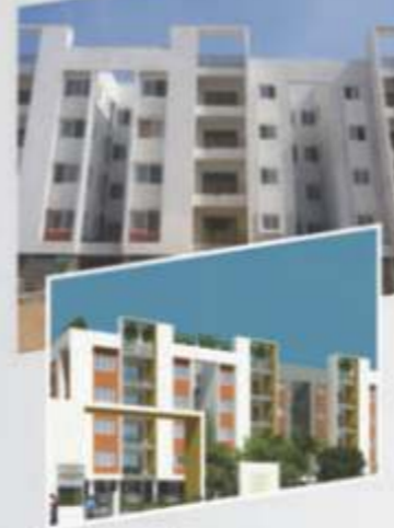
Casa Grande Aldea @ Thoraipakkam