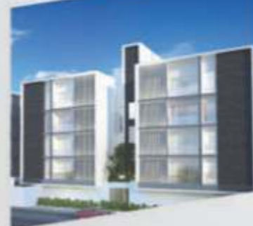
Casa Grande Cedars @ Ayanambakkam