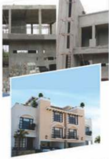
Casa Grande Pallagio @ Thoraipakkam