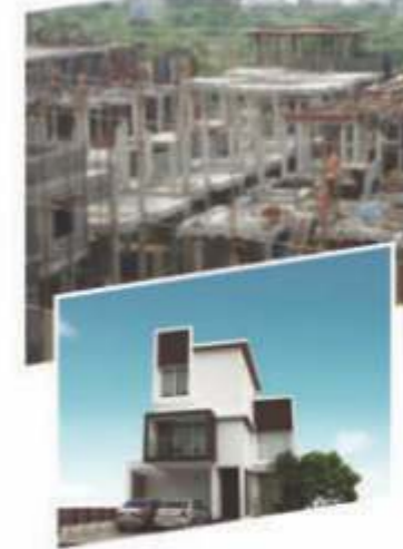
Casa Grande Pavilion-Phase II @ Thalambur