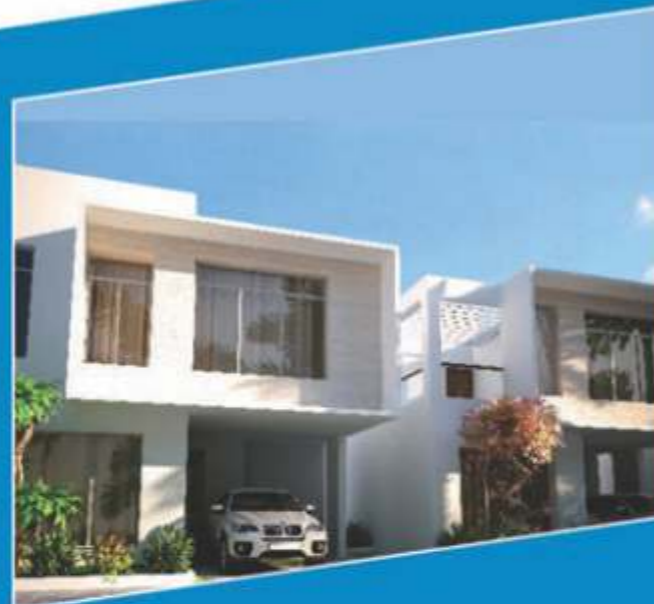
Casa Grande Elan - Villas @ Thalambur • 3 & 4 BHK, 1900 sft onwards