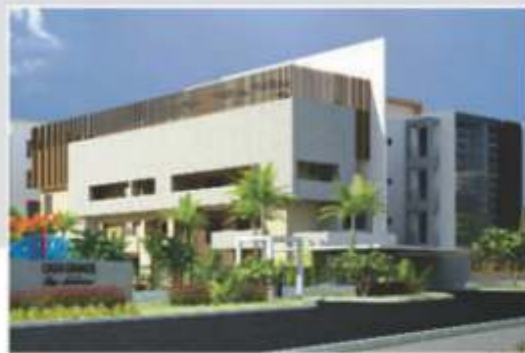
Casa Grande The Address @ Karapakkam