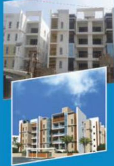
Casa Grande Vogue @ Perumbakkam