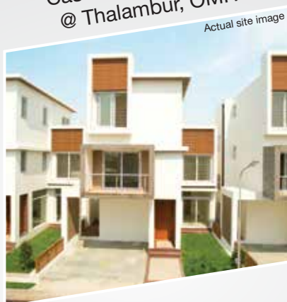
Casa Grande Pavilion @ Thalambur, OMR