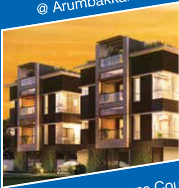
Casa Grande Platina @ Arumbakkam