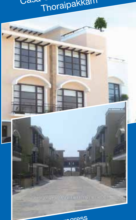
Casa Grande Pallagio @ Thoraipakkam