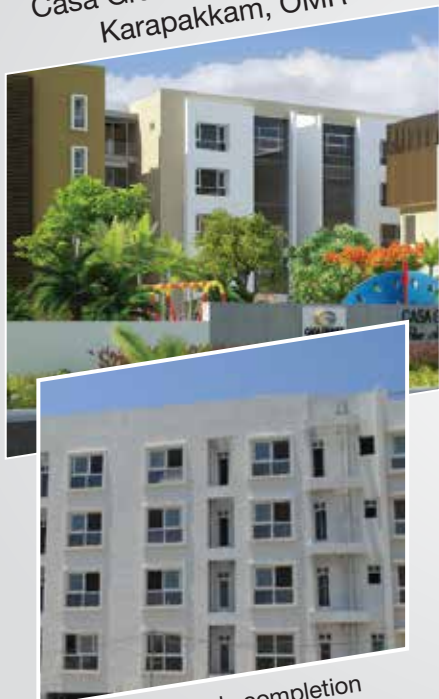
Casa Grande The Address @ Karapakkam, OMR