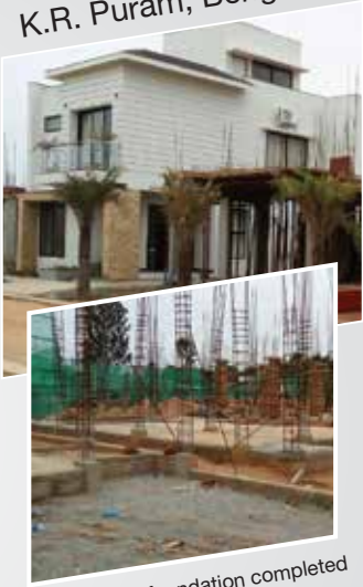
Casa Grande Luxus @ K.R. Puram, Bengaluru