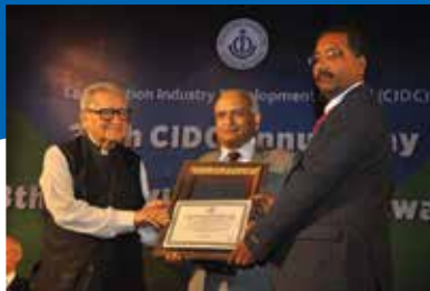
Vishwakarma award for Casa Grande Aldea - Best Archived Project