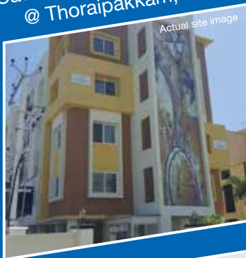
Casa Grande Lanterns Court @ Thoraipakkam, OMR