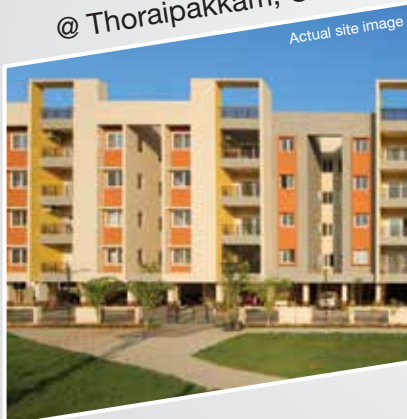
Casa Grande Aldea @ Thoraipakkam, OMR