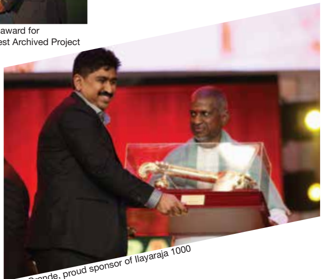
Casa Grande, proud sponsor of Ilayaraja 1000