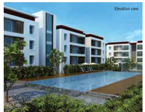
Casa Grande Aristo @ Alandur, Chennai