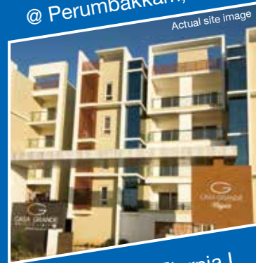
Casa Grande Vogue @ Perumbakkam, OMR