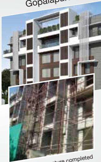
Casa Grande Joybijoy @ Gopalapuram