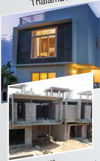
Casa Grande Elan @ Thalambur