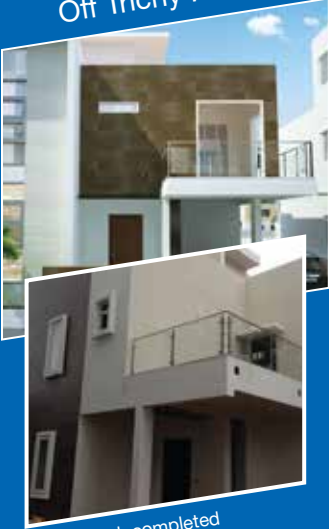
Casa Grande Amber Off Trichy Road