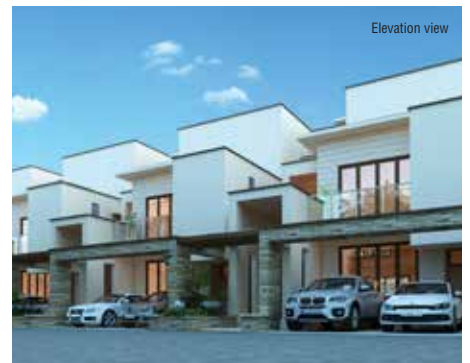
Casa Grande Luxus @ K.R. Puram, Bengaluru