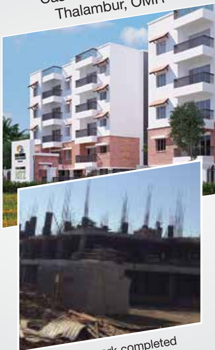
Casa Grande RITZ @ Thalambur, OMR