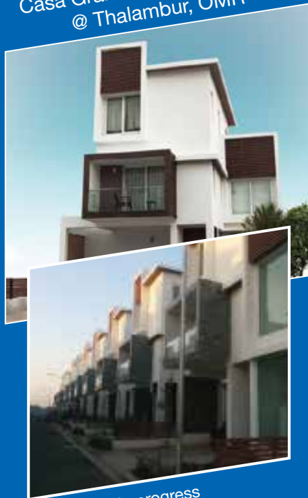
Casa Grande Pavilion Phase II @ Thalambur, OMR