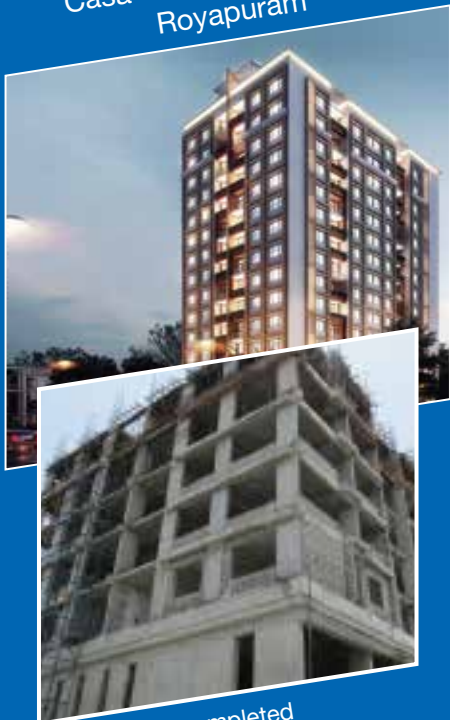
Casa Grande Maseys @ Royapuram