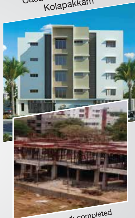
Casa Grande Vivant @ Kolapakkam