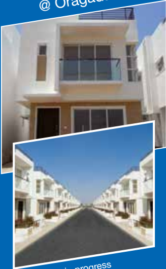
Casa Grande Arena Phase I @ Oragadam