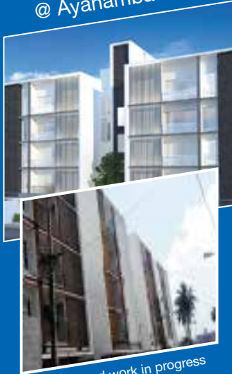
Casa Grande Cedars @ Ayanambakkam