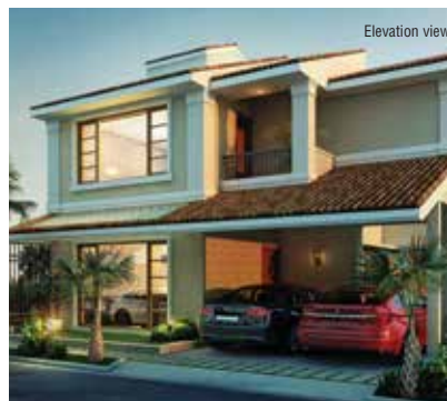
Casa Grande Tiara @ Singanallur, Coimbatore