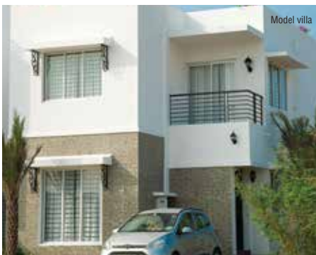
Casa Grande Arena Phase II @ Oradham, Chennai