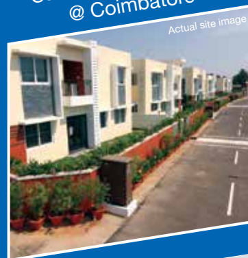
Casa Grande Eternia I @ Coimbatore