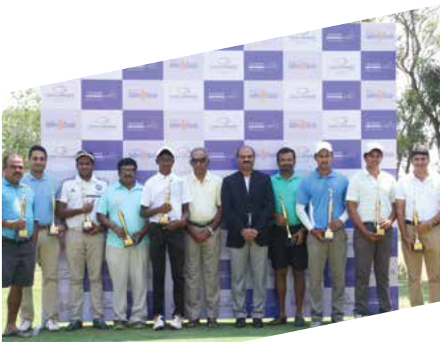
Golf classic - Coimbatore