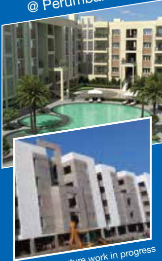
Casa Grande Cherry Pick @ Perumbakkam